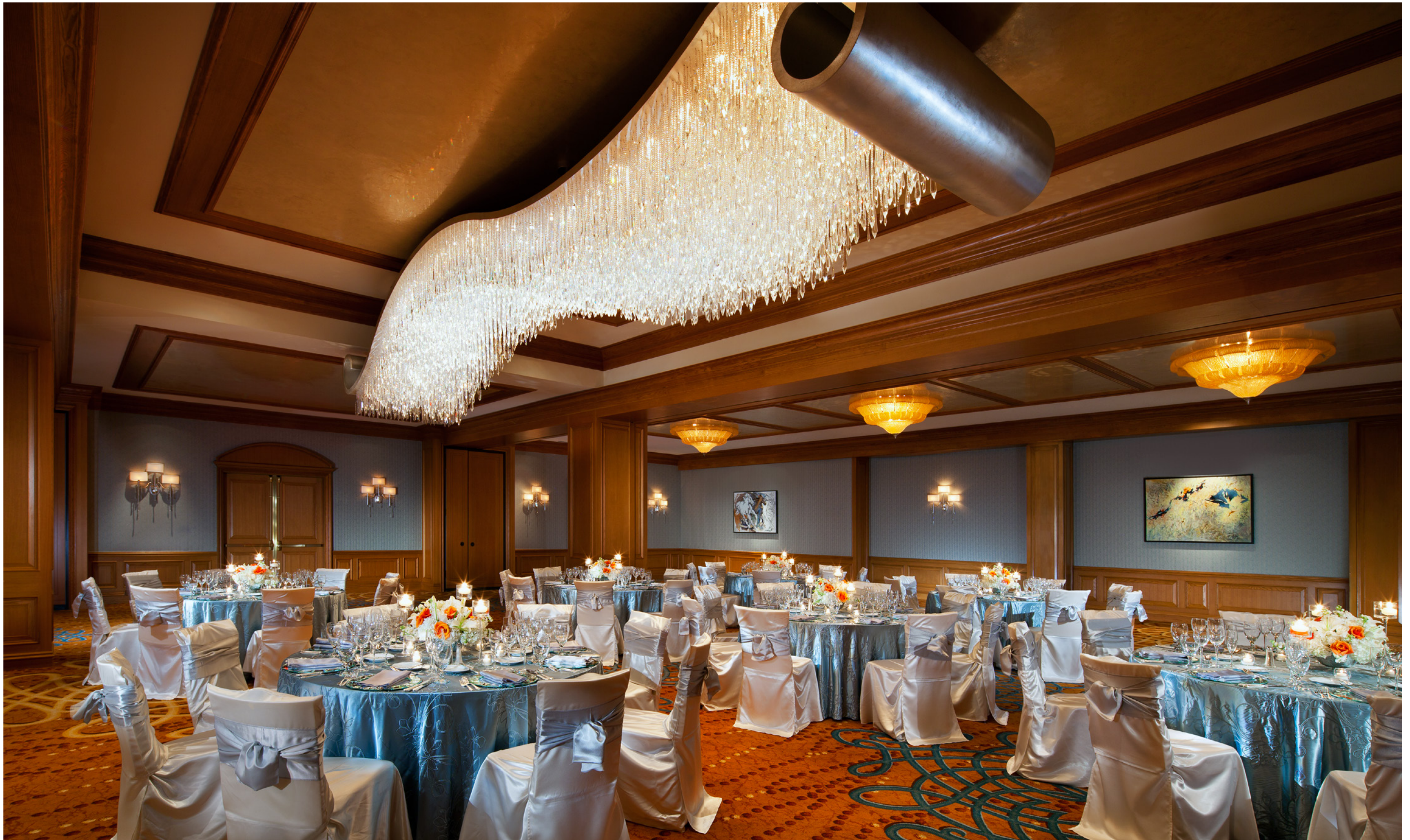
ASTOR BALLROOM – contemporary yet elegant.