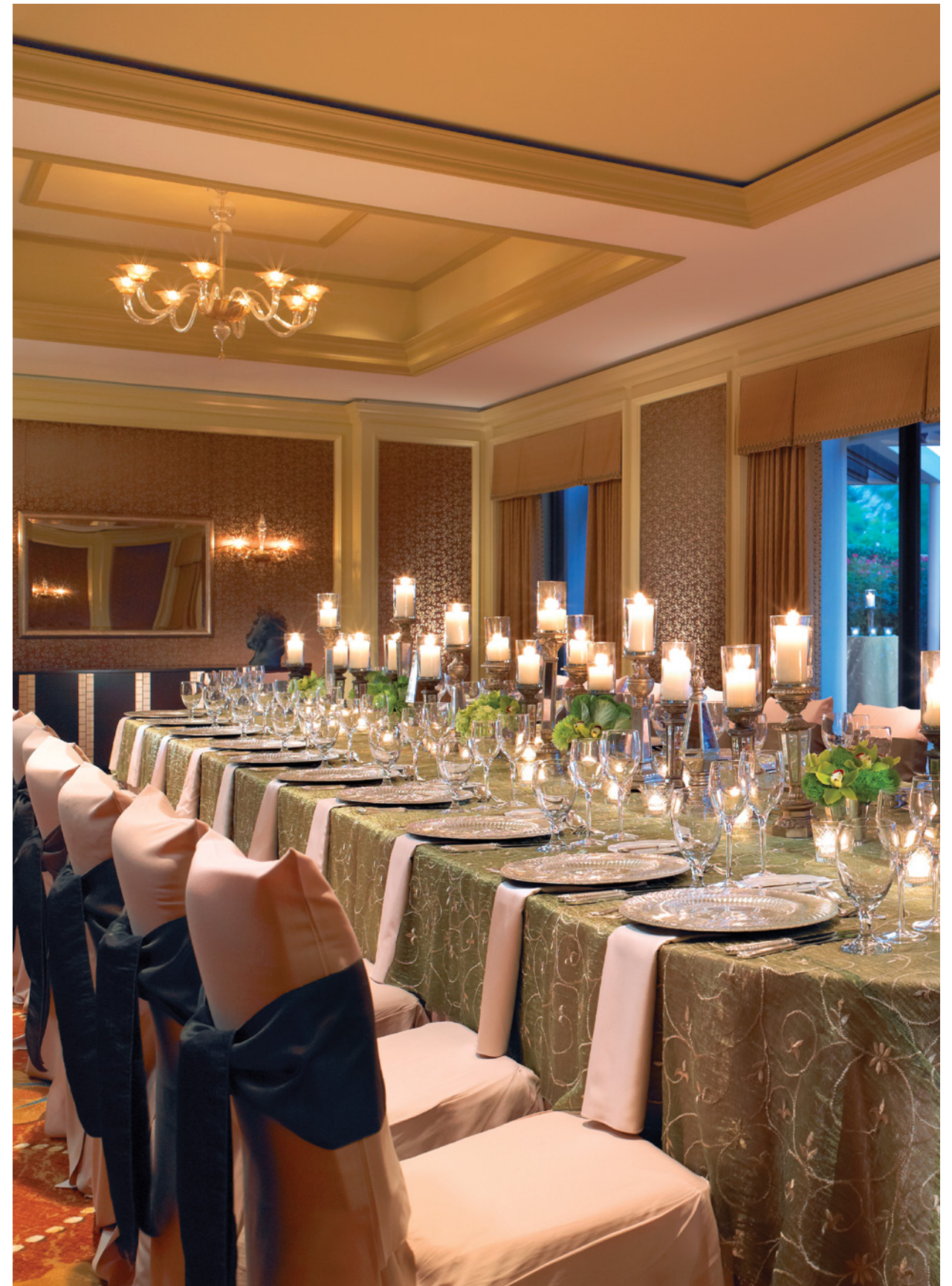
THE COLONNADE - Bespoke service and refined surrounds.

A flawless backdrop for special occasions, the flexible layout and separate guest entrance of the Astor Ballroom easily accommodate weddings of up to 250 guests and social events of up to 360 guests with unique flair.