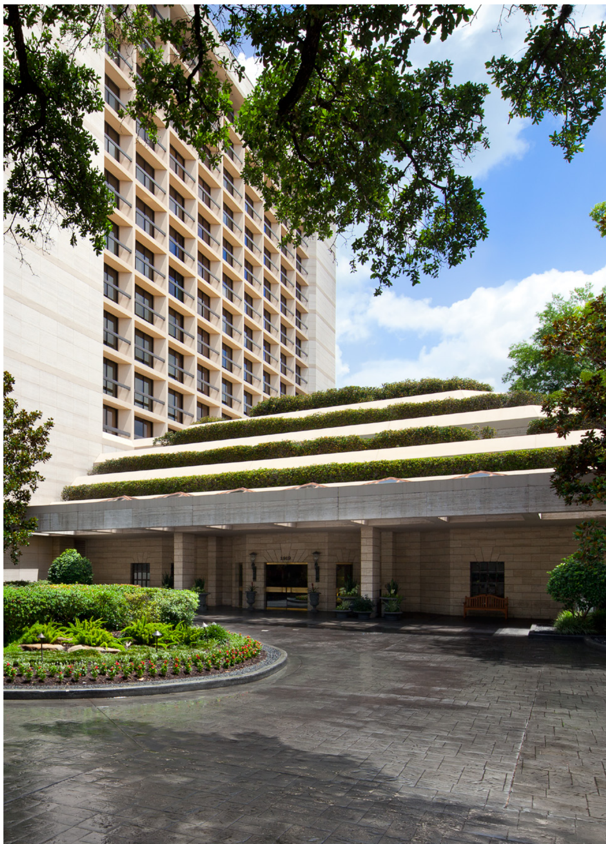
EXTERIOR – an elegant entrance to a bespoke experience.